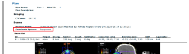
Fig. 4: Report Coordinate System

For more information on setting the IEC coordinate systems please see <link to site config wiki>