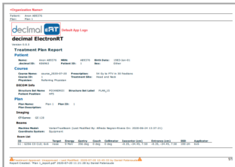
Fig. 2: Custom Header

The header will be placed as shown in figure 2 . Note: The header image is not scaled and is placed on the report at it's native size. We recommend the image to be less than 75 pixels in height to prevent impacting report content and usability.