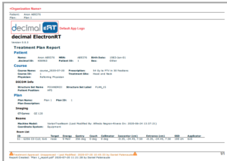
Fig. 2: Custom Header

The header will be placed as shown in figure 2 . The header image is not scaled and is placed on the report at its native size.