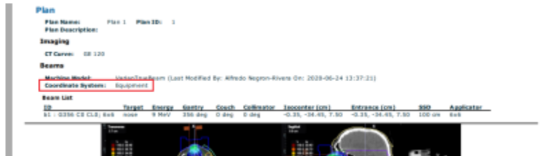
Fig. 4: Report Coordinate System

The selected coordinate system option will be displayed on the treatment plan report as either “Equipment” or “IEC” as shown in the figure 4 below.